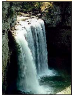
Fall Creek Falls

Located on the left bank of Calfkiller River, in a valley at the foot of Cumberland Mountain, the community of Sparta is a land of green valleys, rolling rivers and majestic hills.