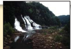
Fall Creek Falls