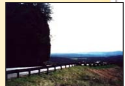
Scenic View of Sparta